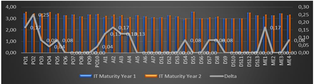
Fig. 3 - Process profiles with increased maturity scores

Next we do an analysis of the evidence from maturity assessment in year 1 and year 2. The analysis focuses on processes where the maturity score rises.